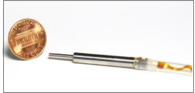
Subminiature DVRT (8 mm stroke)

Features of our DVRT's include micron resolution, linear analog output, flat dynamic response to kHz levels, and very low temperature coefficients. Free-sliding transducer cores are lightweight, strong, and corrosion resistant. Spring tipped DVRT's feature